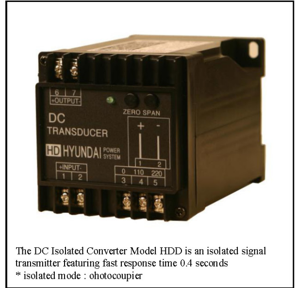
The DC Isolated Converter Model HDD is an isolated signal transmitter featuring fast response time 0.4 seconds * isolated mode : photocoupler